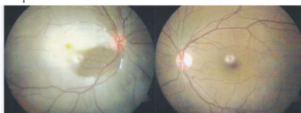
Fig. 1: Fundus photograph of the subject showing CRAO (Central Retinal Artery Occlusion) with spared cilioretinal artery (red arrow) in the Right eye. Left eye fundus is normal in appearance. Note the TMA emboli in the arterioles (Blue arrows).

The optical coherence tomography (OCT) revealed thickening of the Retinal Nerve Fiber Layer (RNFL), which confirms edema of the retinal tissue (Figure 2). Visual prognosis was explained and despite retinal ischemia time of 4 hours had elapsed, a trial of ocular massage and hyperbaric